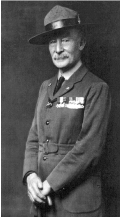
Robert Baden-Powell founder of the Scout movement

“The most worth-while thing is to try to put happiness into the lives of others.”