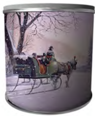
Chocolate Lovers Tin